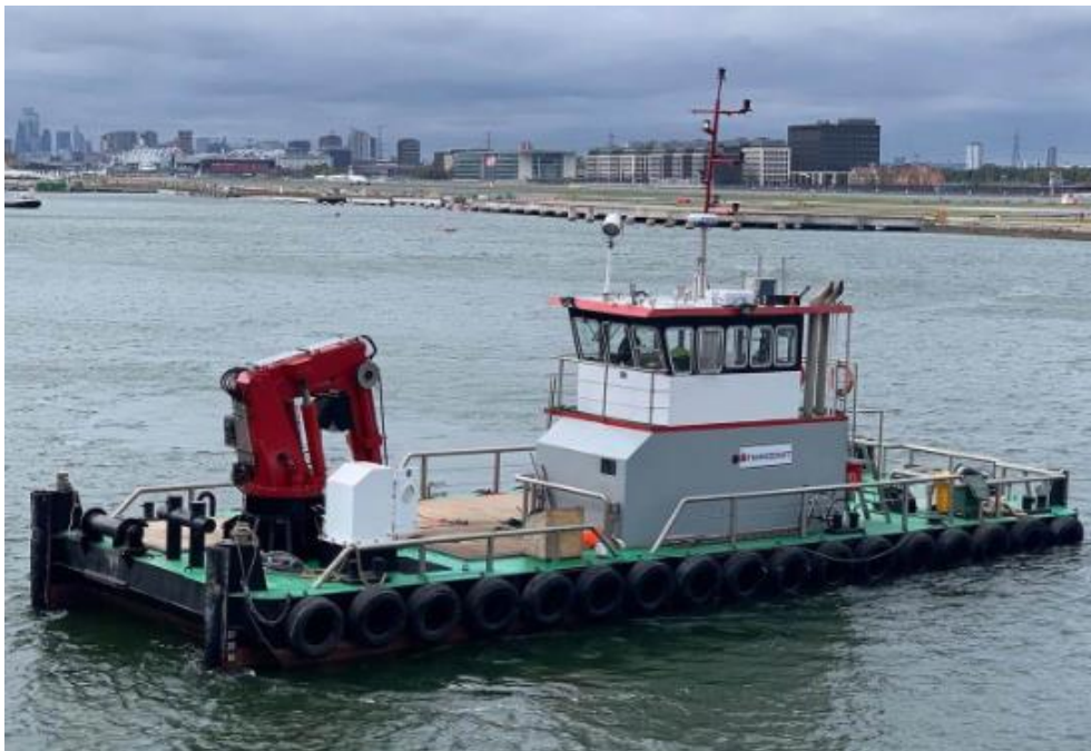
Sophie D (Dalby Venture) - Multicat