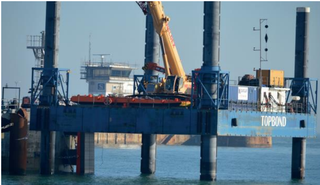
Topjack -jack up barge