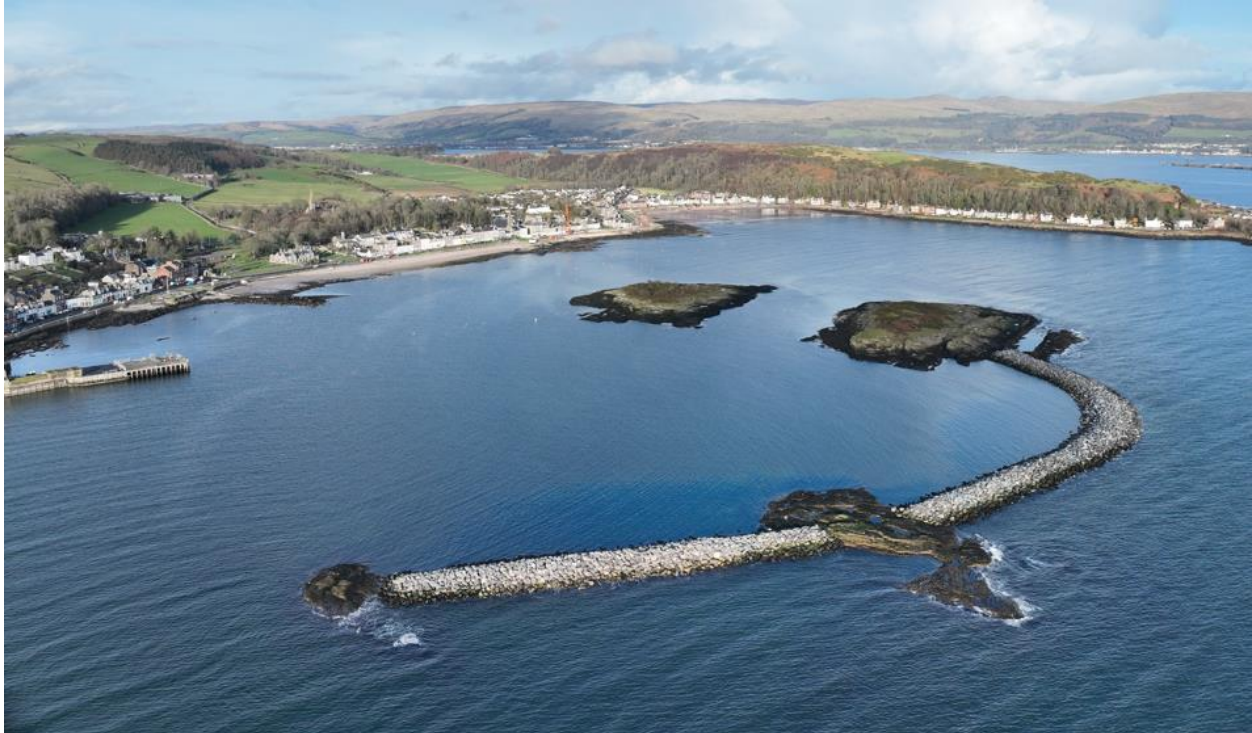
Image above shows the construction of the breakwater prior to the new Navigational Aids being installed.

Mariners are requested to proceed with caution when navigating within this area, particularly, as paper and electronic charts may still need to be updated to reflect the construction of the new breakwater and the locations of the new Navigational Aids.