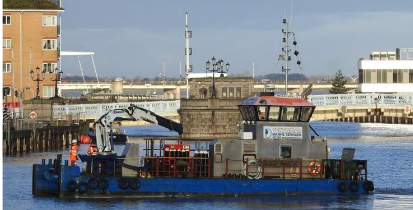
Fig. 3 – Sheerkhan