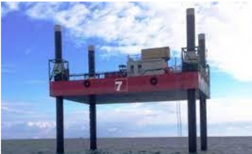
Fig. 5 – Haven Seariser 3