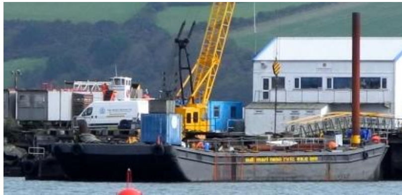
Fig. 4 – BCDK 6464