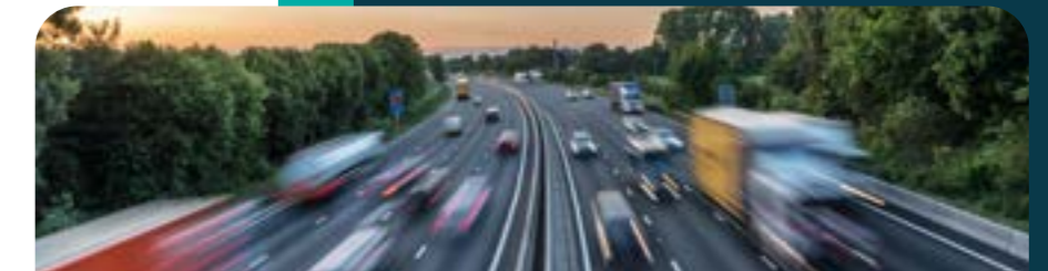
Close to major road junctions (M2)