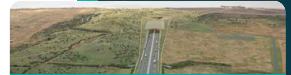
Lower Thames Crossing

With connections to the M2, M20, and M25 motorways, as well as direct links to cities such as Birmingham, Manchester, and the Midlands, London Medway provides easy access to the UK's largest economic zones, including its thriving logistics, retail, automotive, and construction industries.