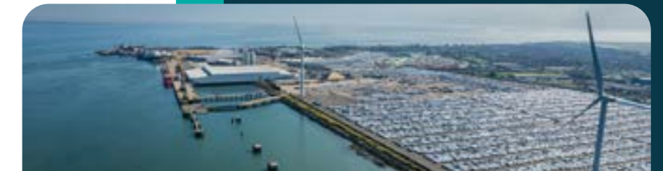
Positioned on The Thames Estuary