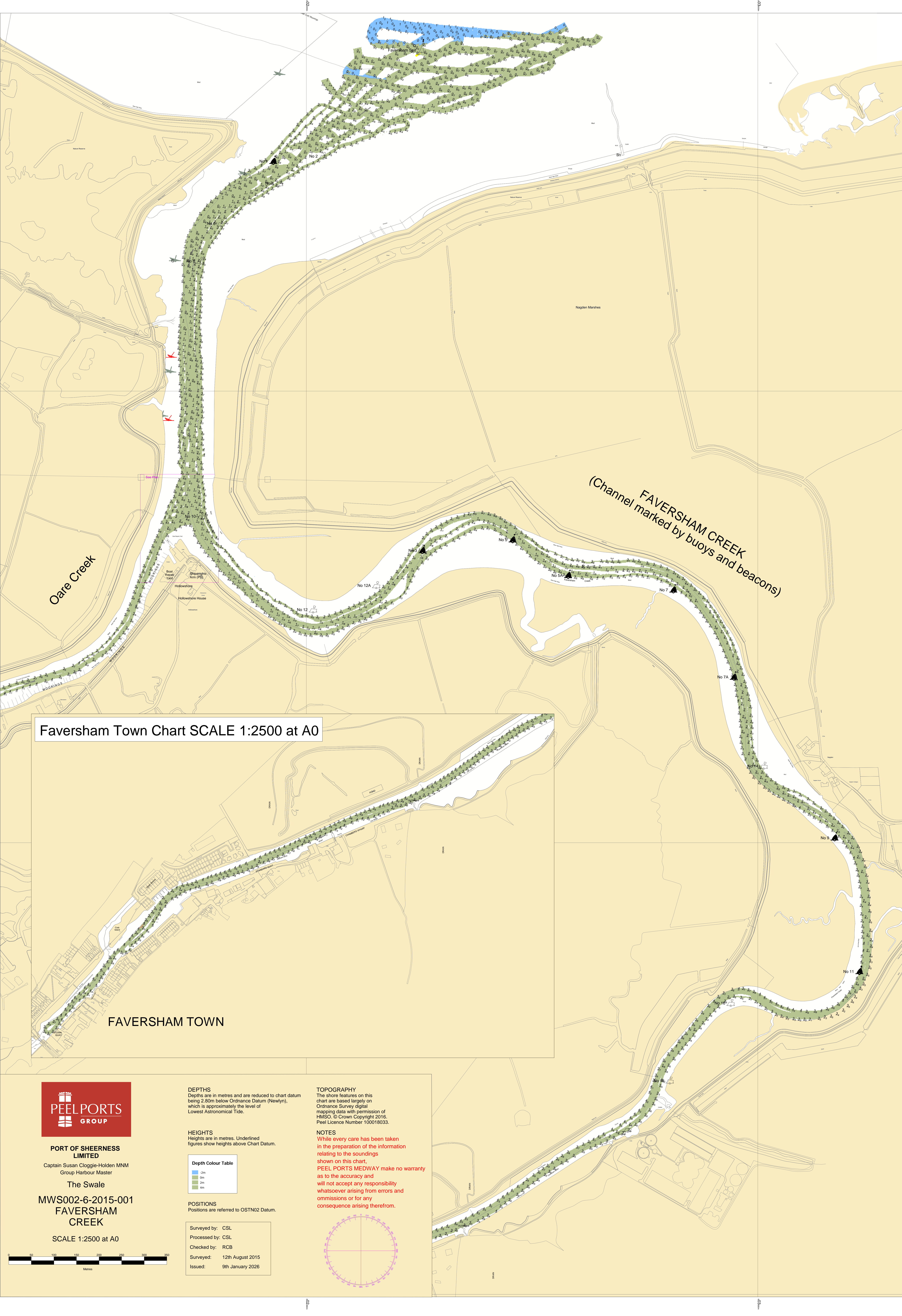
Faversham Town Chart SCALE 1:2500 at A0