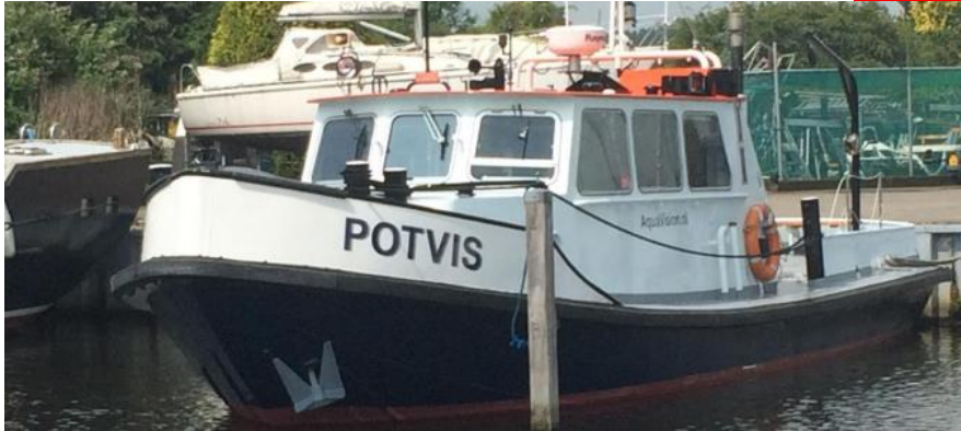
Fig. 1: TB Safety boat POTVIS

The works are expected to be completed September 2024 (which includes landside work to concrete and slab services).