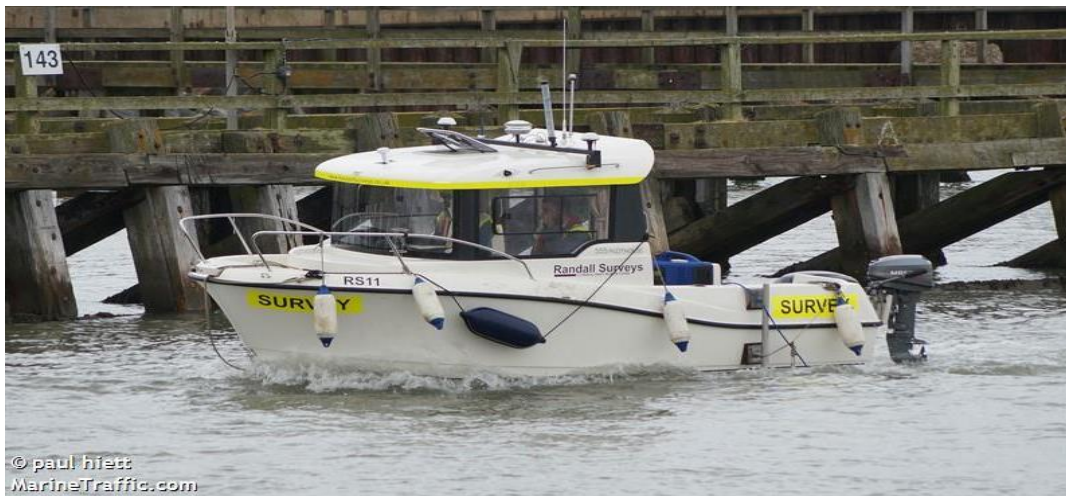
Fig. 1 – Survey Vessel RS 11

Due caution should be exercised by all vessels operating within the area highlighted in Green, shown below in Fig 2-Survey area by maintaining safe distance. RS 11 can be contacted on VHF Ch12.