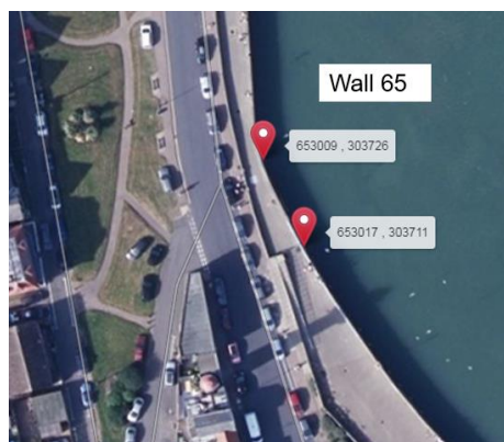
Fig. 4 – Brush Bend

Great Yarmouth Port Company Limited Vanguard House South Beach Parade NR30 3GY