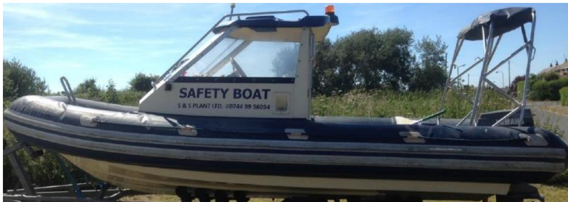
Fig. 1: BAM Safety Boat

MARINERS ARE HEREBY ADVISED that survey work will be undertaken by BAM Nuttall on quay piling within Great Yarmouth River Port from Monday 26 th April 2021 until Wednesday 28 th April 2021. The survey vessel (callsign 'BAM Safety Boat') will monitor VHF Ch12.