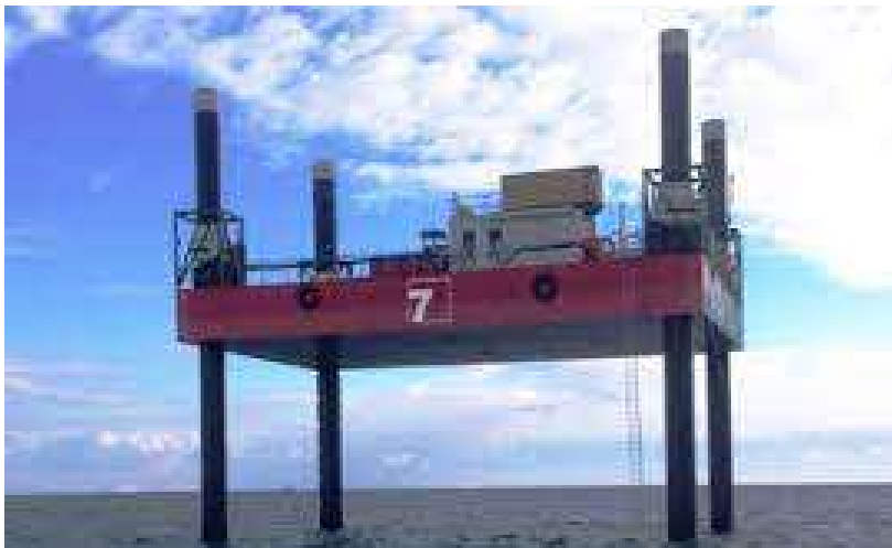
Fig. 5 – Haven Seariser 3