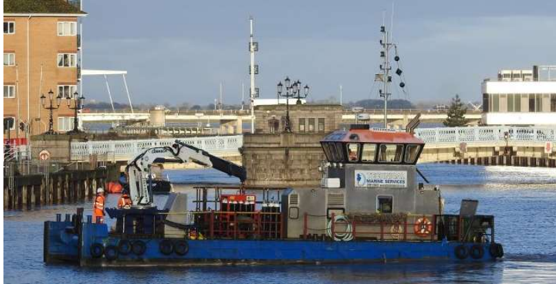
Fig. 3 – Sheerkhan