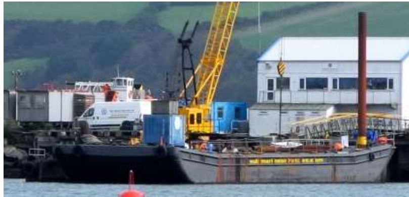
Fig. 4 – BCDK 6464