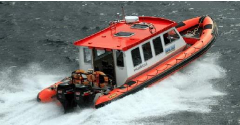
Celtic Navigator/Wanderer/Explorer (Support Vessels) – 12 hour (day) operations