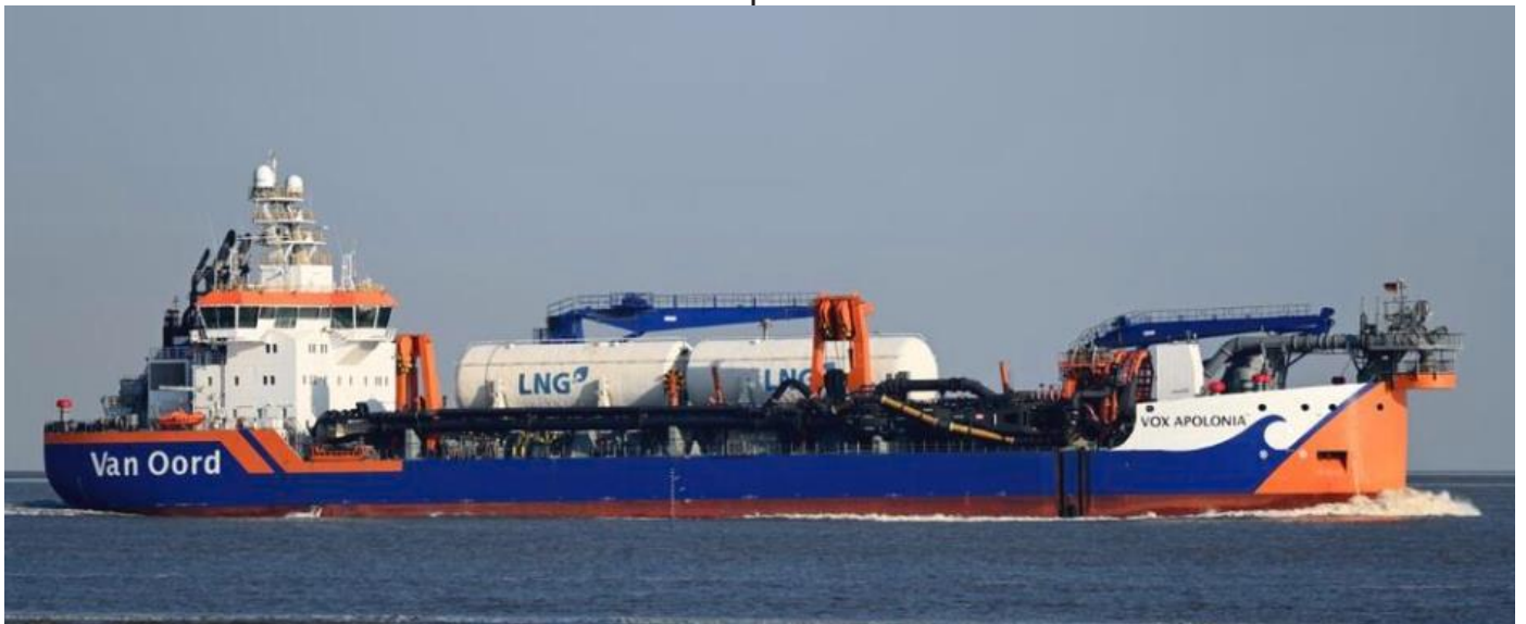
TSHD “Vox Apolonia”

“Vox Apolonia” and “Maas” will display the required signals for respective operations by day and night, all vessels transiting the Medway Approach Channel are requested to navigate with caution, maintain a listening watch on VHF Ch.74 and reduce speed and wash if requested to do so.