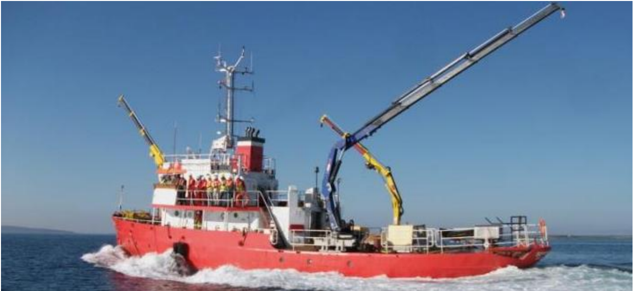
KML Vessel SEVEN SEA

area are requested to remain outside 500m from the vessel whilst operations are taking place and avoid impeding her track when on survey lines. The vessel will be monitoring VHF Ch 16 and Ch 12.