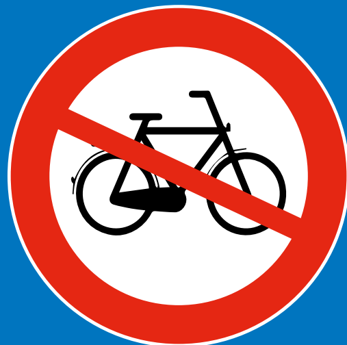
NO CYCLING IN OPERATIONAL AREAS OR ON PAVEMENTS

IN LOW LIGHT, USE FRONT WHITE AND REAR RED LIGHTS