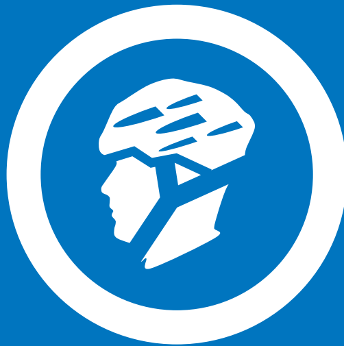
CYCLIST'S SAFETY HELMET