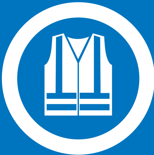
HI-VISIBILITY REFLECTIVE VEST