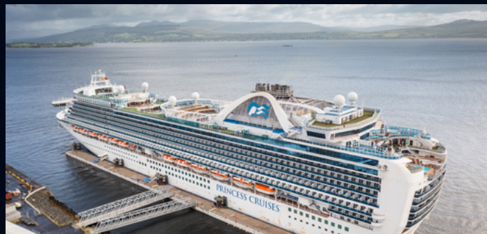
Greenock & Glasgow, Scotland