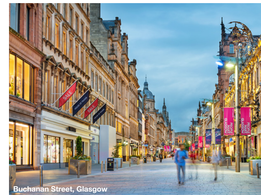
Buchanan Street, Glasgow