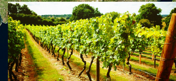
Chapel Down Vineyard