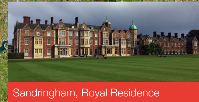
Sandringham, Royal Residence