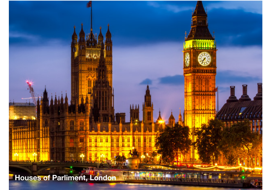
Houses of Parliament, London

The region also boasts some magnificent natural gardens and inspiring museums such as the Turner Contemporary. Surprising to many, Kent is one the biggest wine producing regions in Britain, many award winning wines are made here and some of these fine vineyards are just a stones throw away from the port of London Medway.