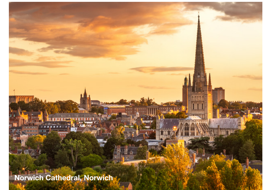
Norwich Cathedral, Norwich