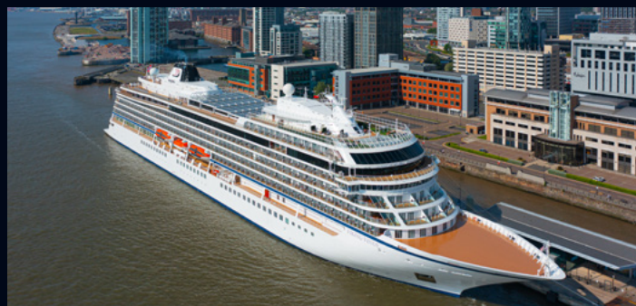
Liverpool, North West England