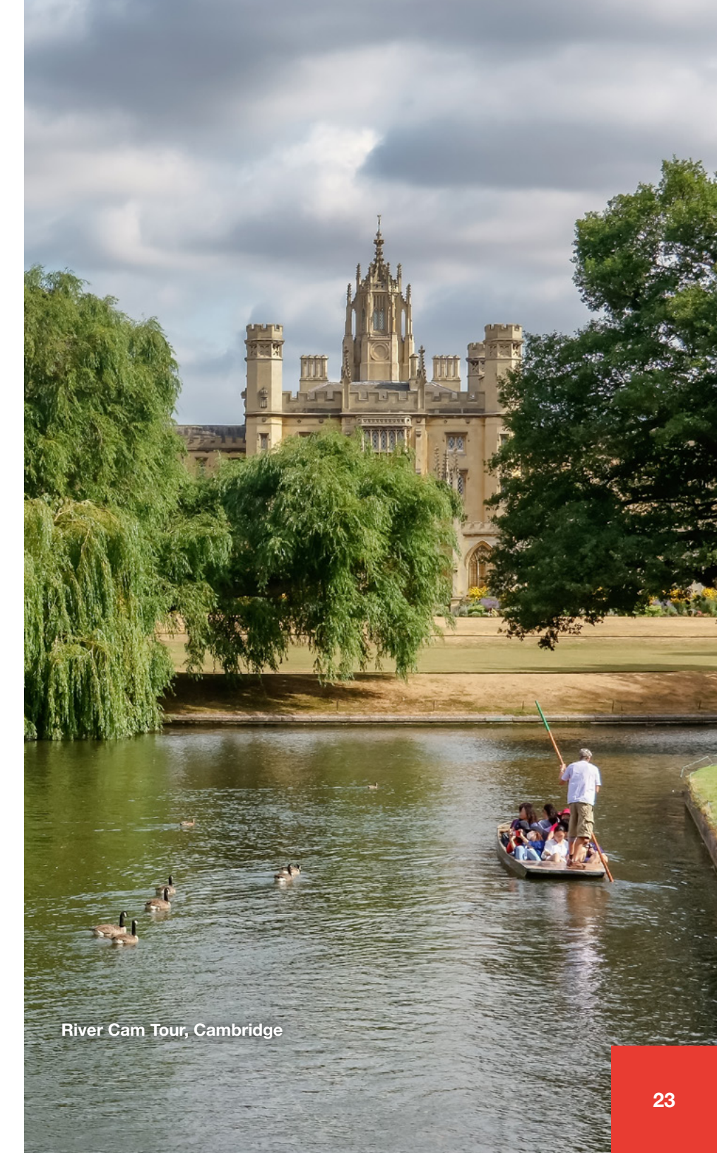
River Cam Tour, Cambridge

The Port of Great Yarmouth is owned and operated by Peel Ports Group