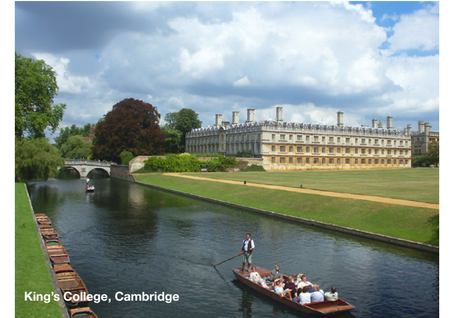
King's College, Cambridge

The University City of Cambridge, brimming with history, tradition and scholarly charm would make an ideal stop as part of a magical heritage tour.