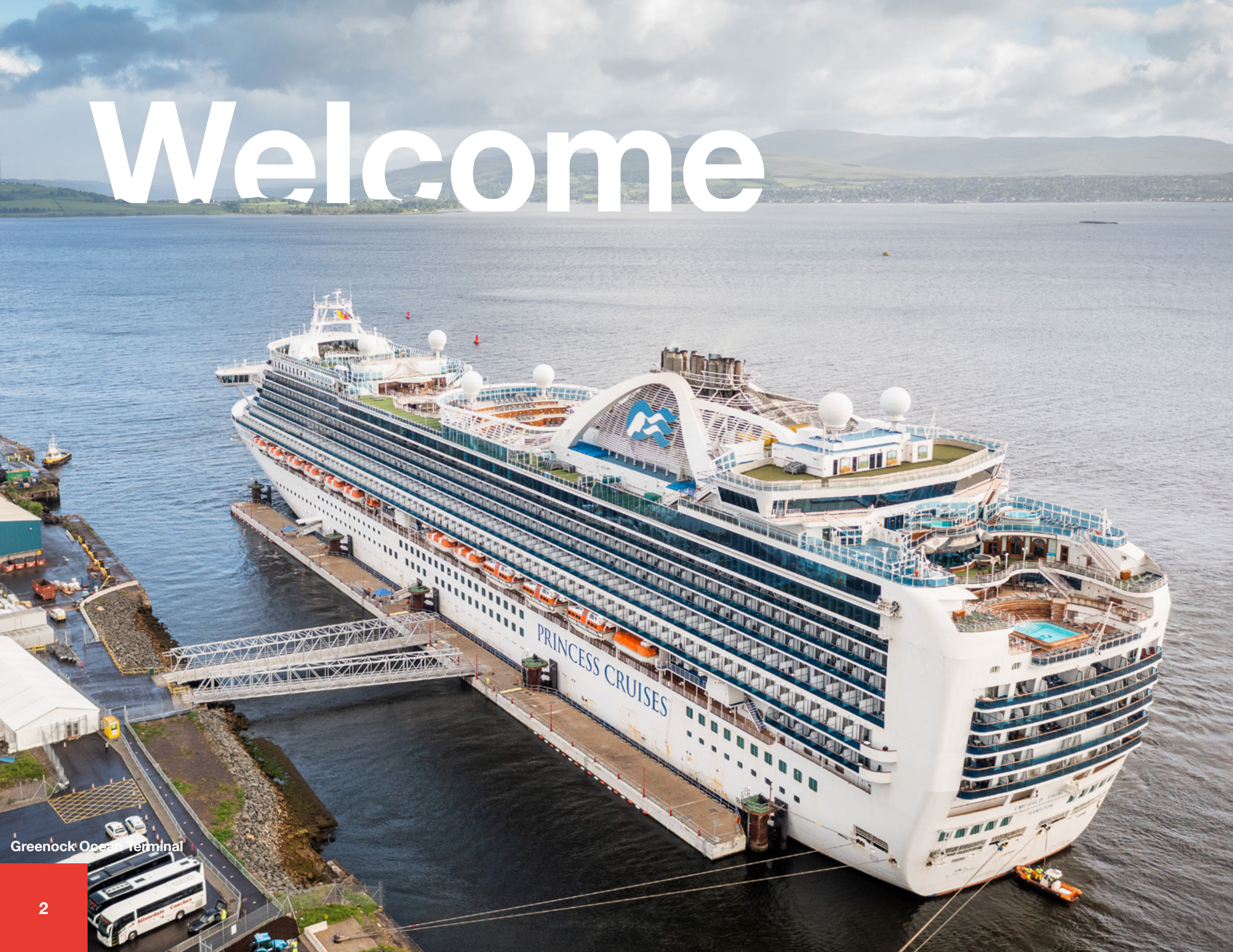
Greenock Ocean Terminal