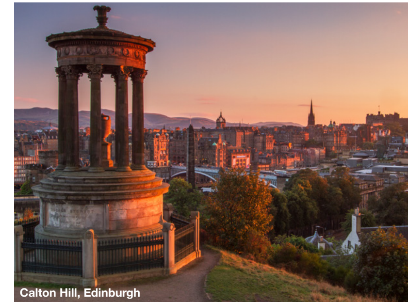
Calton Hill, Edinburgh

Greenock welcomes over 100 cruises and thousands of passengers every year. It's the ideal port of call to access Edinburgh, Glasgow and some of the most visited and popular tourism hot spots on the west coast of Scotland.