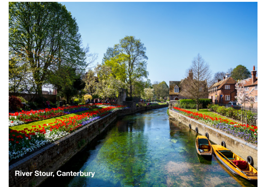
River Stour, Canterbury