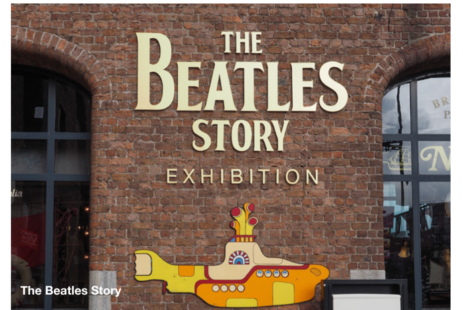
The Beatles Story